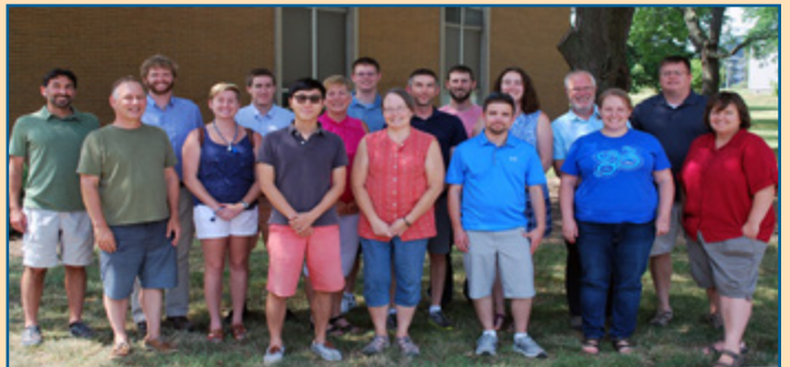
QUANTITATIVE FISHERIES CENTER Michigan State University C.D. "Buzz" Besandny Award for Fostering Great Lakes Partnerships